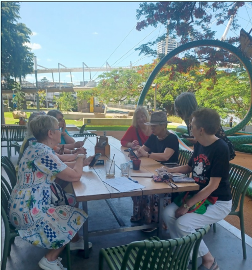
Left and below: Happy walkers in the U3A-X30 Affordable Adventure group; pix taken during the recent Landsborough excursion.

Once a month, they enjoy friendship and freedom for just 50c a journey, without the burden of driving.