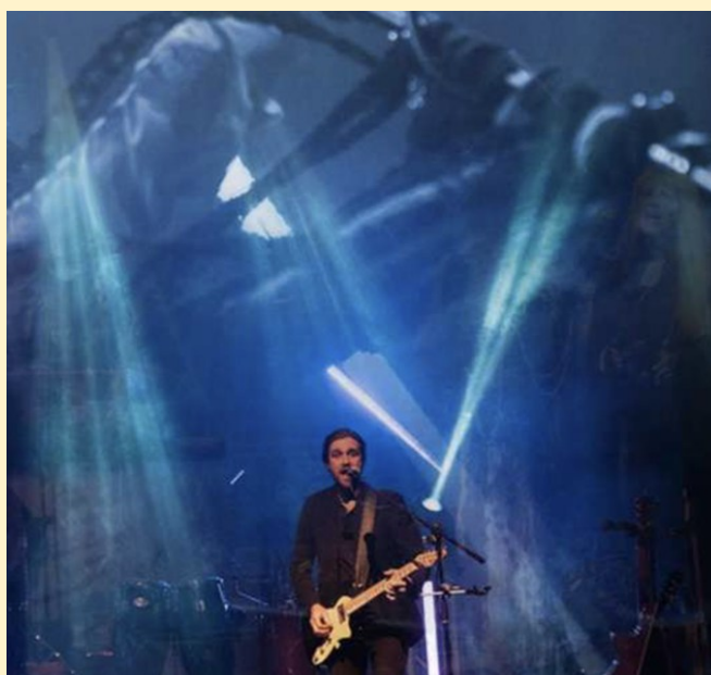
The West End smash hit arrives in Australia soon

Experience all the classic hits including Dreams , Don’t Stop , Everywhere , Songbird and The Chain in a night of pure nostalgia.