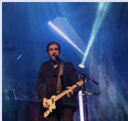
The West End smash hit arrives in Australia

Paying homage to the Rumours era – the band's most commercially